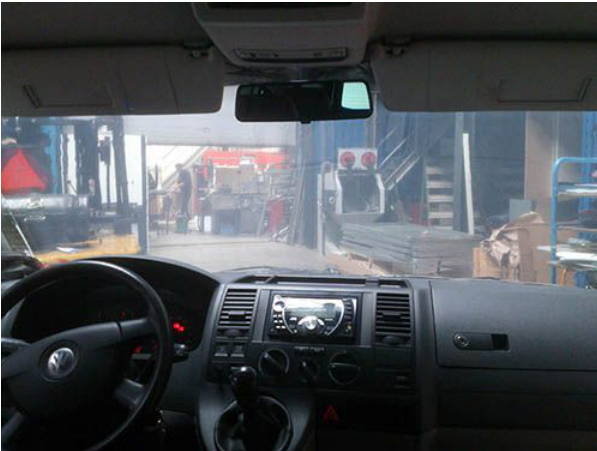
View through shielded windscreen3