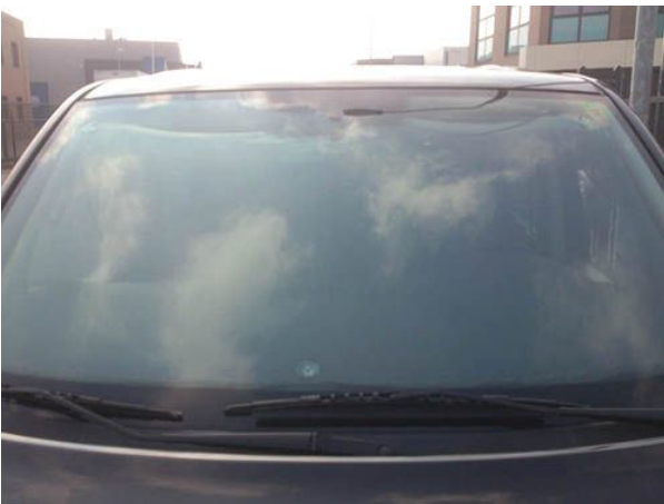
Outside windscreen 2