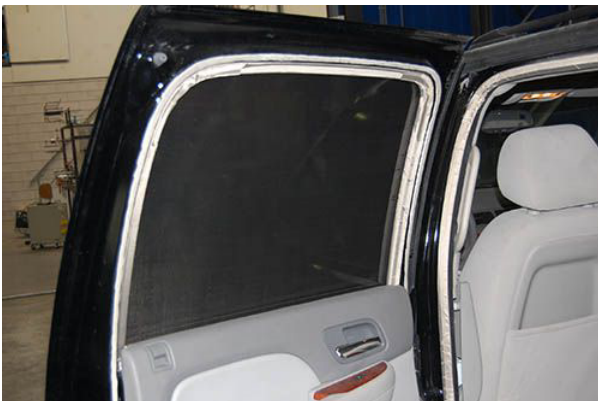
Inside of shielded side window

Please note: the top layer of the shielding foil can be affected by acids, for example from the skin. To protect the conductive layer, you can apply a transparent film or use the adhesive side on top.