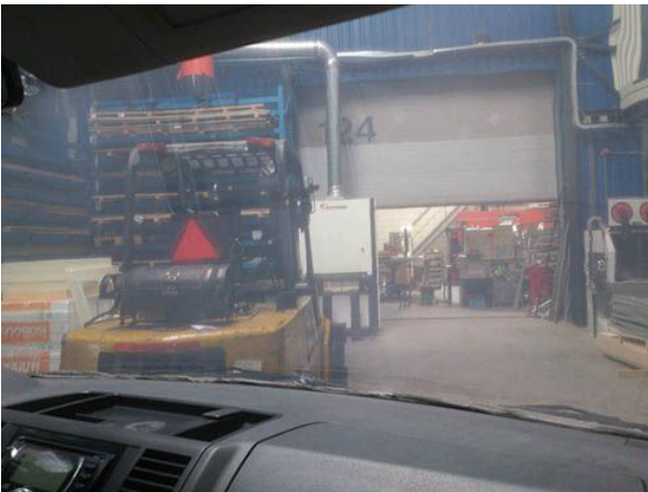
View through shielded windscreen1