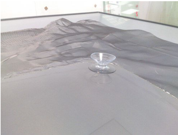
Easy to apply 1

Mounting the shield for signal-jammer cars is achieved easily, by means of suction cups to the windows. The shield we supply will be customized for your make and model car.