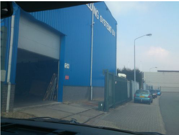
View through shielded windscreen4