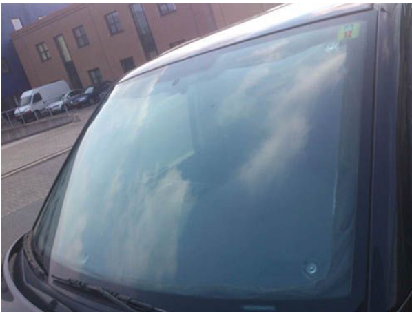
Outside windscreen 3