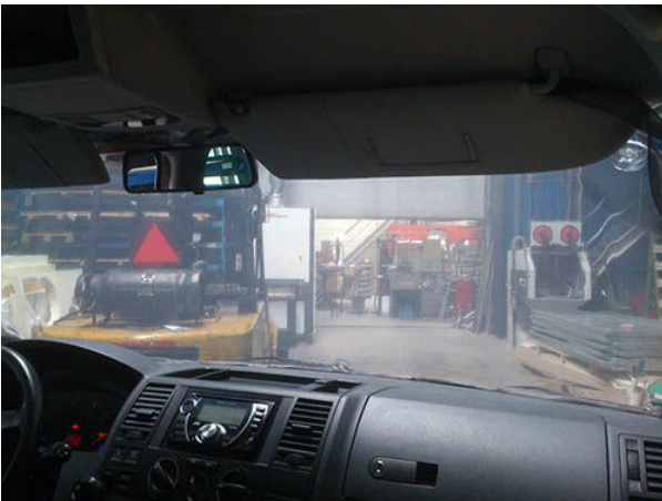
View through shielded windscreen2