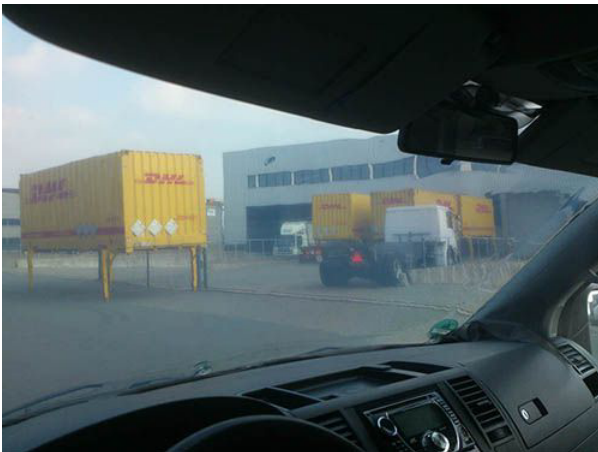
View through shielded windscreen 4