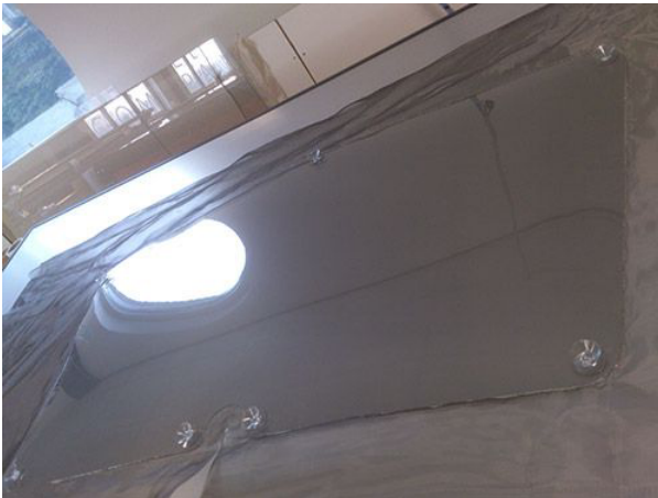
Easy to apply 2